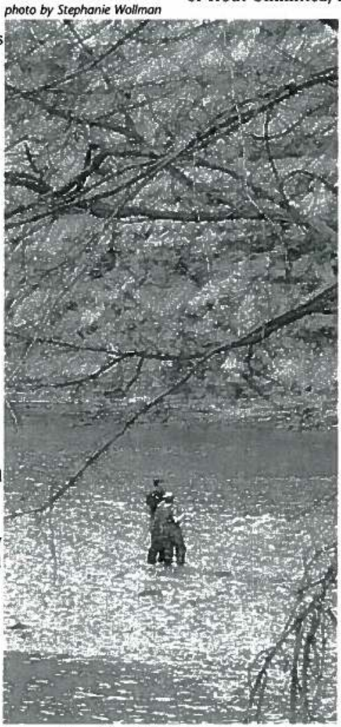
Anglers will benefit from the Rocky River Flow Gage Upgrade project.