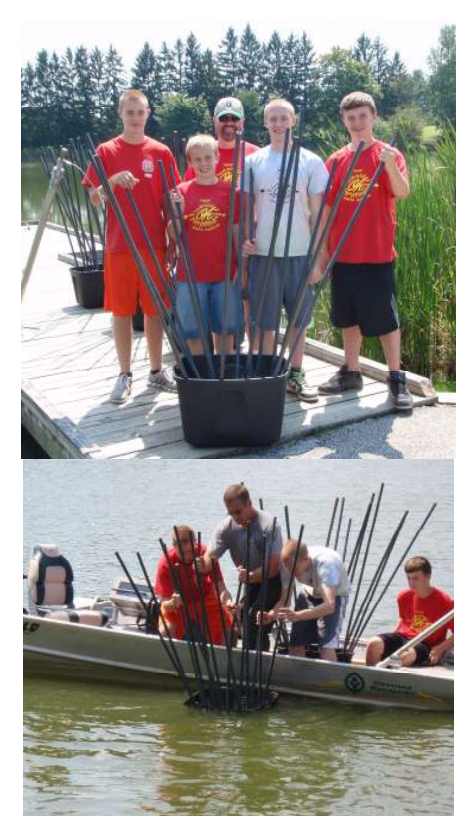
Figure 1. Photos of Ledge Lake Fish Attractor Structures (19 August 2011)